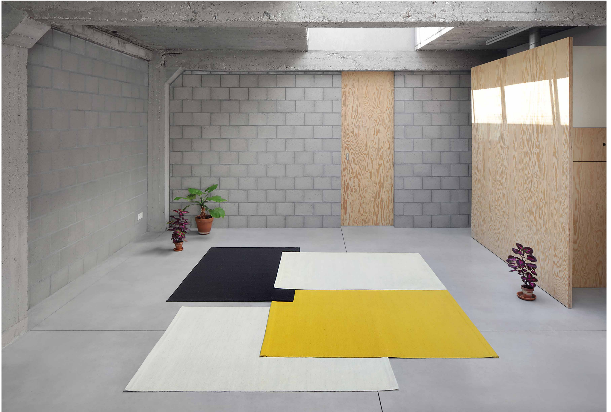
Composition #4: Natural, Gold, Natural, Black (4x) 120x170 cm, handwoven 100% hand-spun NZ Wool