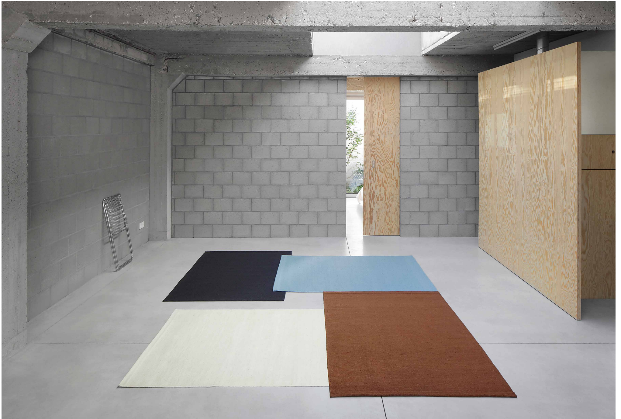
Composition #3: Sky blue, Chocolate, Natural, Black (4x) 120x170 cm, handwoven 100% hand-spun NZ Wool