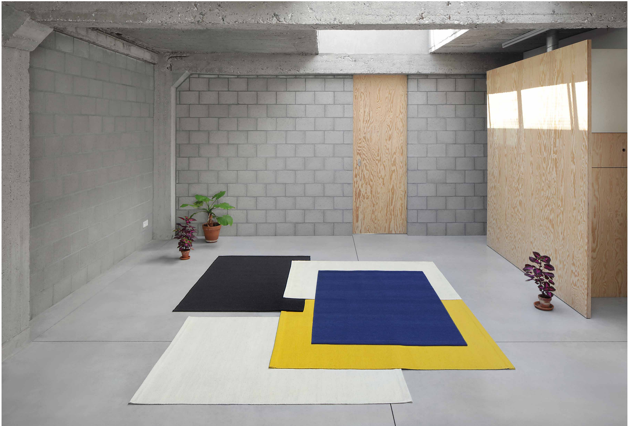
Composition #2: Natural, Midnight blue, Gold, Natural, Black (5x) 120x170 cm, handwoven 100% hand-spun NZ Wool