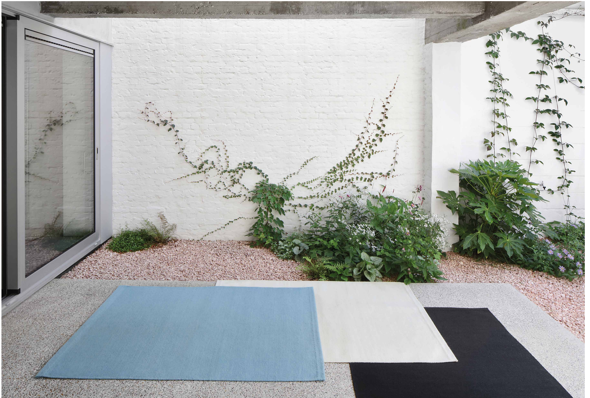
Composition #5: Sky blue, Natural, Black (3x) 120x170 cm, handwoven 100% hand-spun NZ Wool