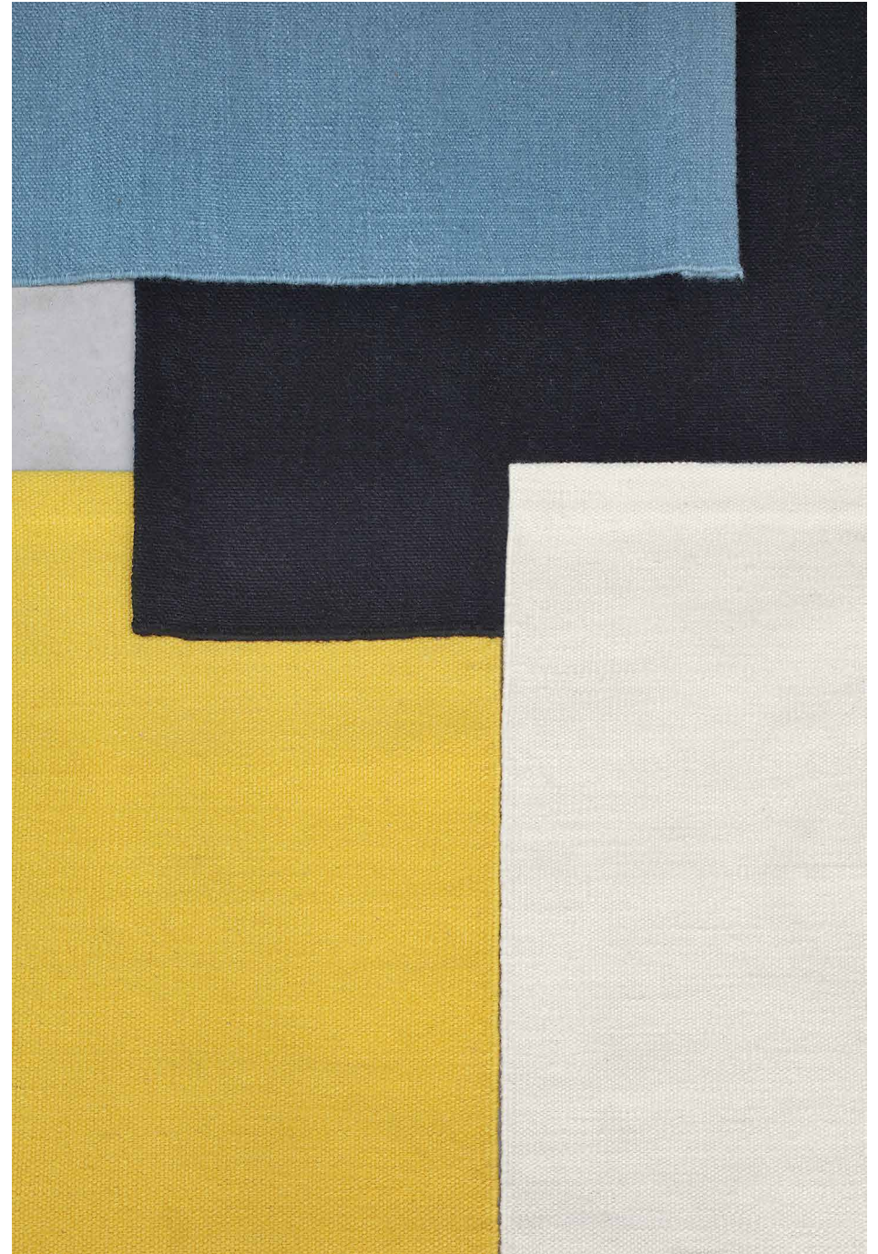
Sky blue, Black, Natural, Gold handwoven 100% hand-spun NZ Wool